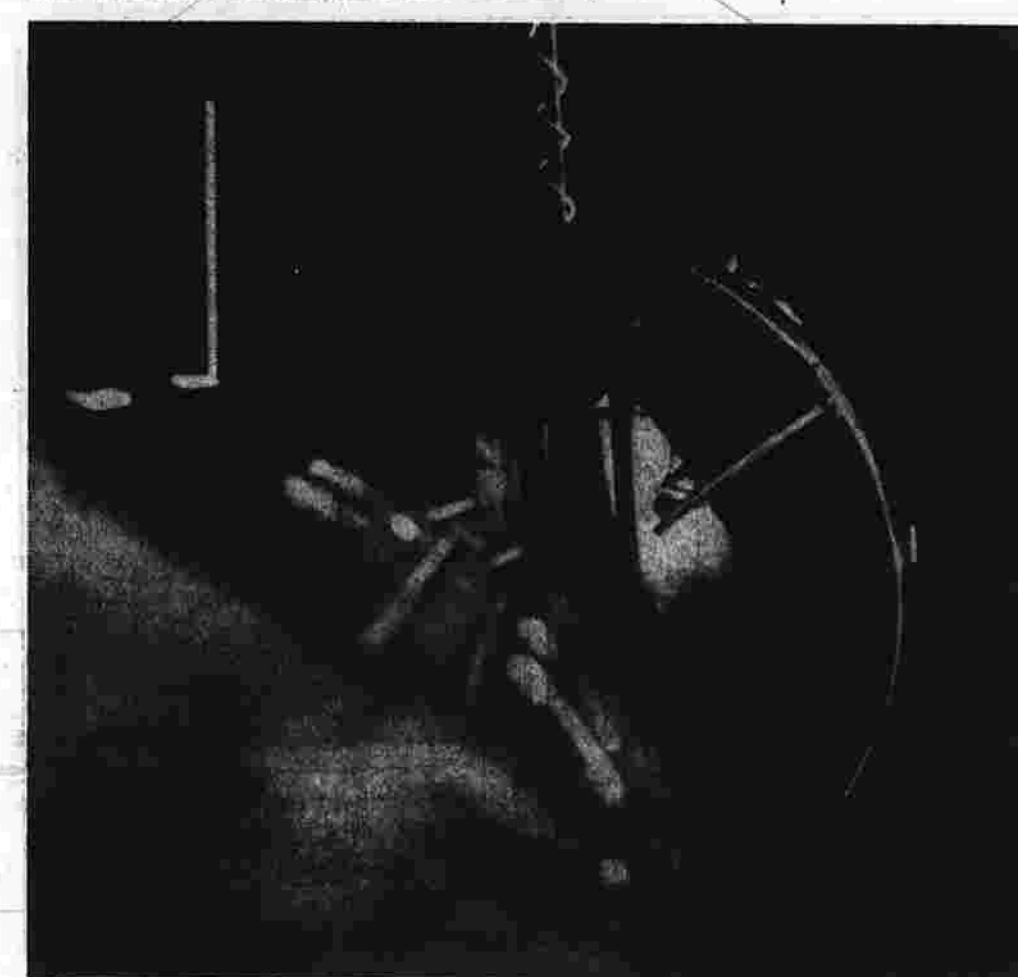
The nose of Gemini maneuvers in close to complete docking.